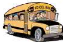
How Ice Cream Is Made: Video Field Trip

For the first time, DVD sets of PBS39 Video Field Trips have been distributed to 280 area northeast Indiana schools, representing more than 174,000 students (K-12). Thanks to the financial support of the American Honda Foundation, teachers can now access these materials that emphasize early learning in math, science, consumer economics, health and safety and financial education. The accompanying teacher's guides and learning activities are based upon national education standards and provide a variety of learning opportunities for students in kindergarten through high school.